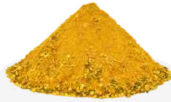
Achar Gosht Masala