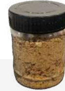
Chapli Kabab Masala