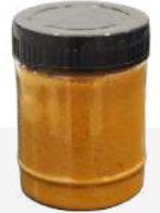
Haleem/Karahi Gosht Masala