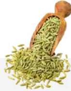
Fennel Seeds/ Soon