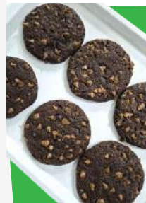
Choc Heaven Cookie