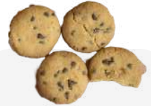
Choc Chip Cookies