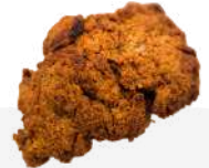
Keto Zinger & Wings