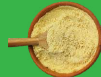
Almond Flour Rs.1150/ 250g