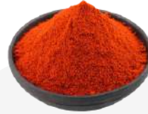
Kashmiri Red Chilli Powder