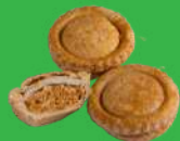
Chicken Patty/ Aloo Patty