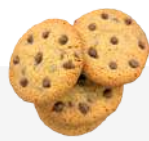
Peanut Butter Cookie

Tin Boxes & butter-based options available on pre-order