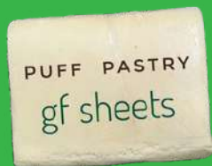
Puff Pastry Sheets