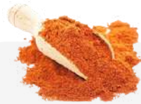
Nihari/Seekh Kabab Masala

grinded in our very own spice milling facility