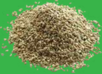
Ajrwan/ Carron Seeds