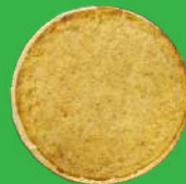
Keto Pizza Base (7-in)