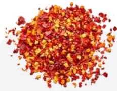
Red Chilli Flakes

grinded in our very own spice milling facility