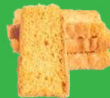
Stevia Cake Rusk