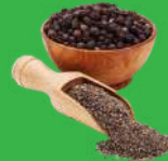
Black Pepper Powder